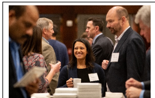
Collaboration and networking