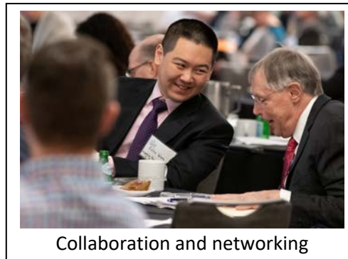
Collaboration and networking

The day began with an illuminating session on SAJF Benefits: Air Quality and Other Atmospheric Research , covering a range of topics including particulate and contrail formation reductions. The data show that SAJF provides more than just greenhouse gas benefits, also enabling significant reductions of tailpipe emissions including particulate matter, unburned hydrocarbons, sulfur oxides, and carbon monoxide.